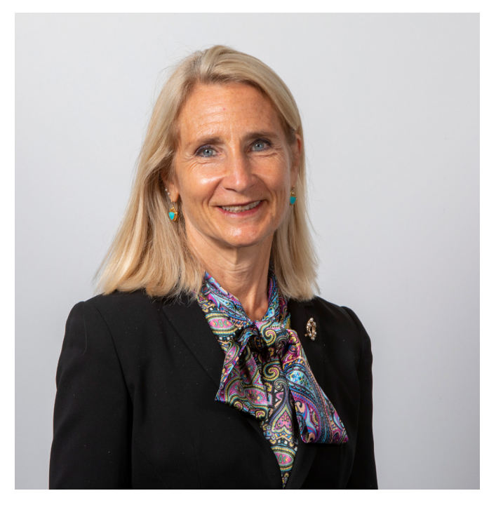
In 2023/24, the SFO will balance delivering its day-to-day mission with implementing long-lasting change.

In recent years, we have seen some of our greatest successes – such as securing the UK's largest ever financial penalty following a guilty plea in the Glencore case – and some disappointments, including the unsuccessful end of cases against former Serco and G4S senior employees. We are committed to using the lessons from our victories and our setbacks to prioritise permanent, impactful improvements.